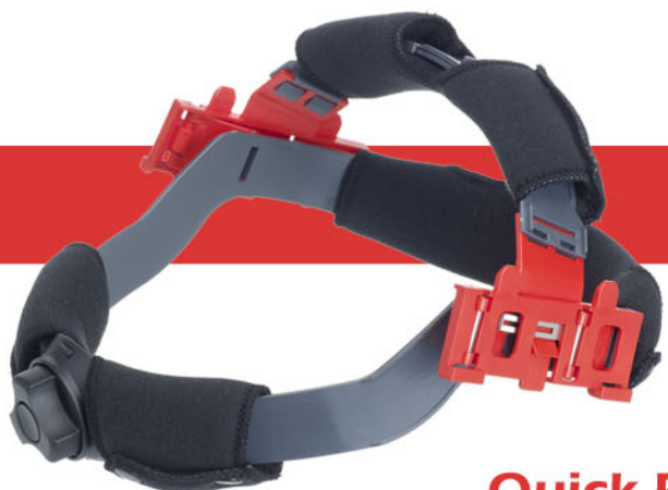
Quick Release Headband as standard