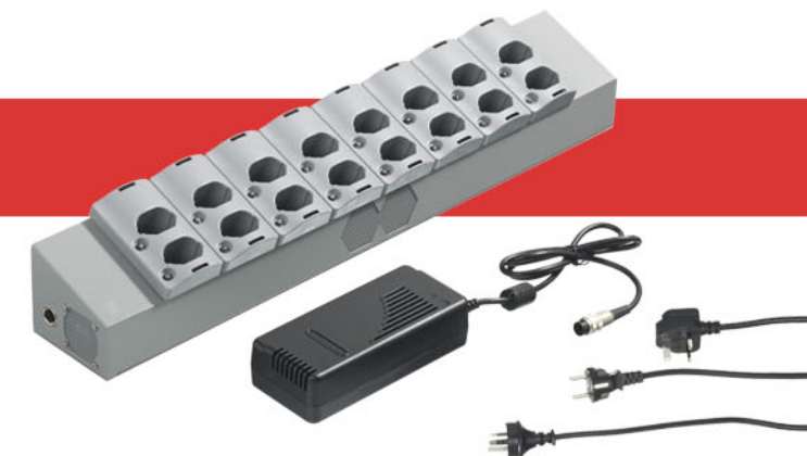
Optional 16 Way Multicharger