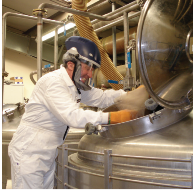
Food preparation and processing – for protection against powder inhalation and mixing splashing