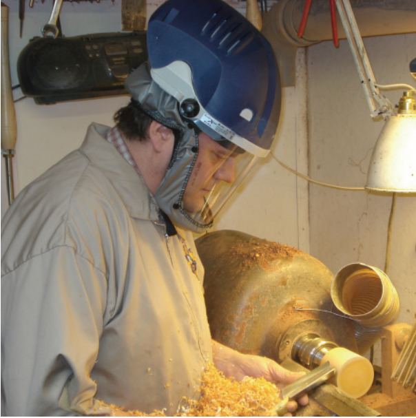
Woodworking and timber preparation - for protection against dust, flying particles, and preservatives