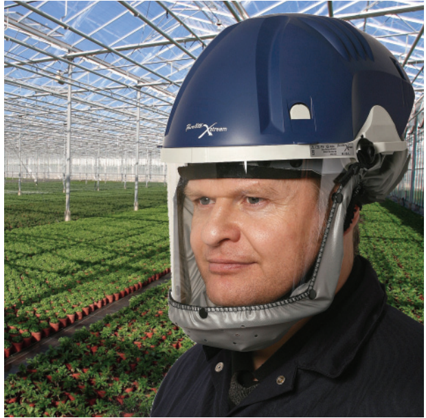
Agrochemical industry - the application of fertilisers and pest control treatments, harvesting and packing

The new Purelite Xstream is a self-contained lightweight Powered Air Purifying Respirator (PAPR) providing all-in-one respiratory protection against dust, fumes and particulates, combined with eye and face protection against impact and liquid splash.